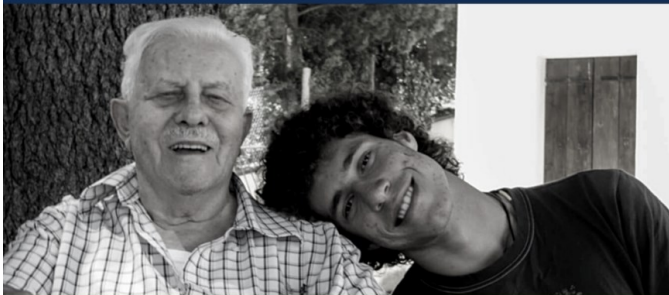
Pope Francis has chosen the theme for the first World Day for Grandparents and the Elderly